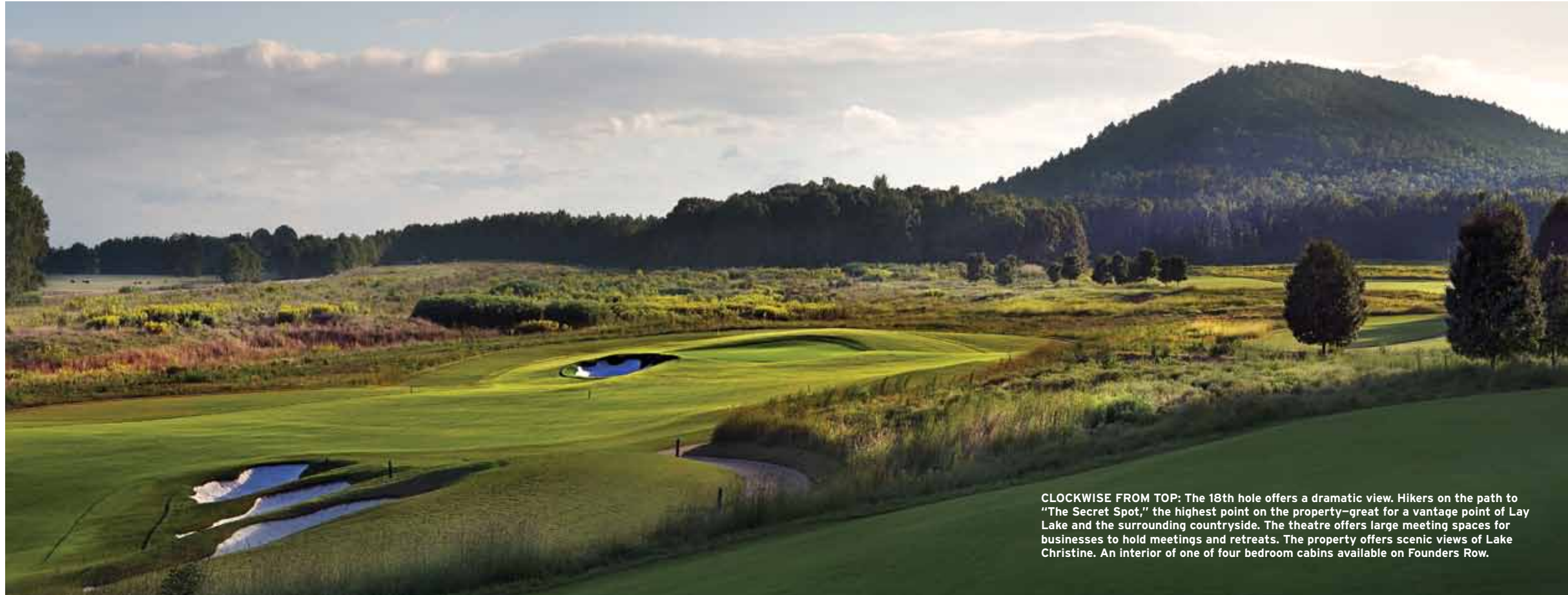
CLOCKWISE FROM TOP: The 18th hole offers a dramatic view. Hikers on the path to "The Secret Spot," the highest point on the property—great for a vantage point of Lay Lake and the surrounding countryside. The theatre offers large meeting spaces for businesses to hold meetings and retreats. The property offers scenic views of Lake Christine. An interior of one of four bedroom cabins available on Founders Row.